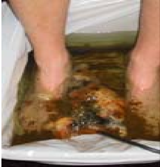
AFTER 10 MINUTES